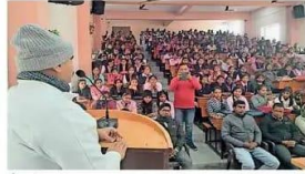
छात्राओं को जांच करती डॉक्टर व स्वास्थ्यकर्मी और छात्र-छात्राओं को संबोधित करते अतिथि।